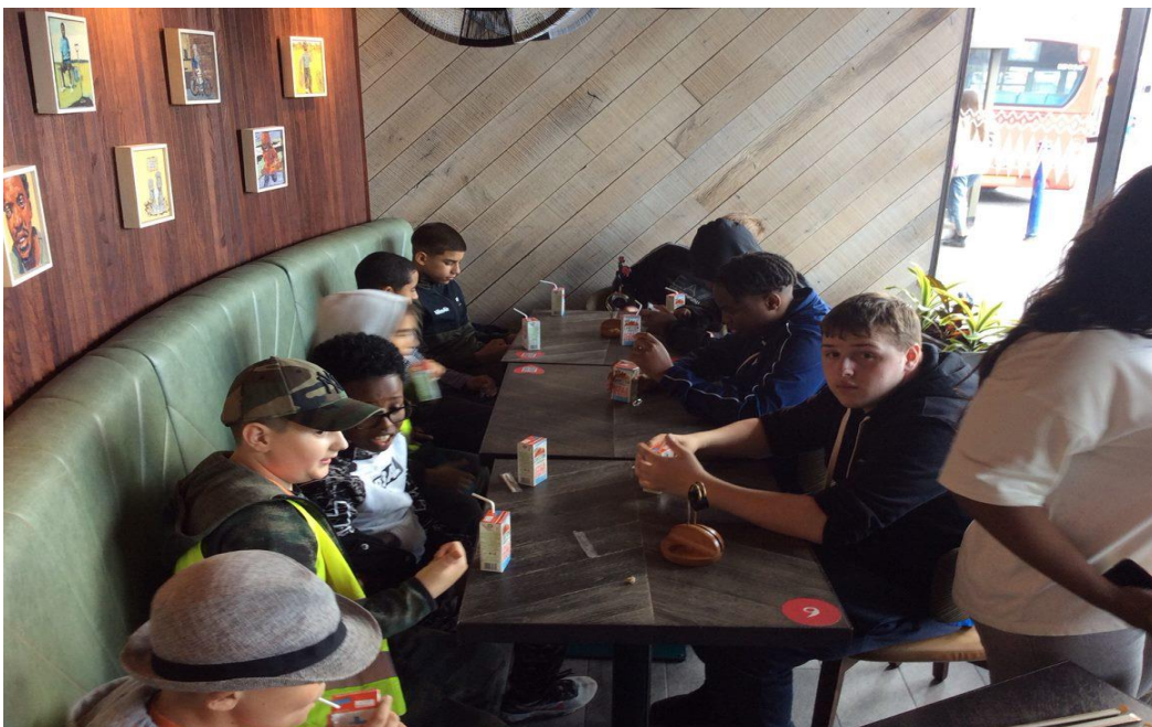
Followed by lunch!