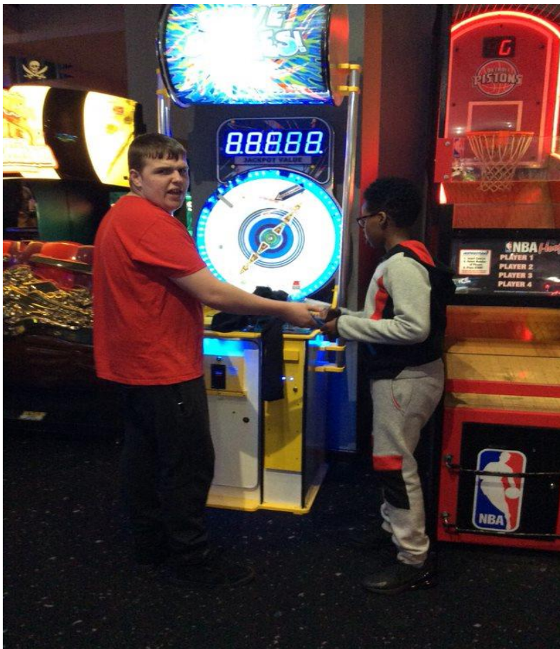
Who can conquer the arcade?!