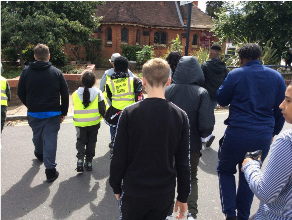
We visited the local area