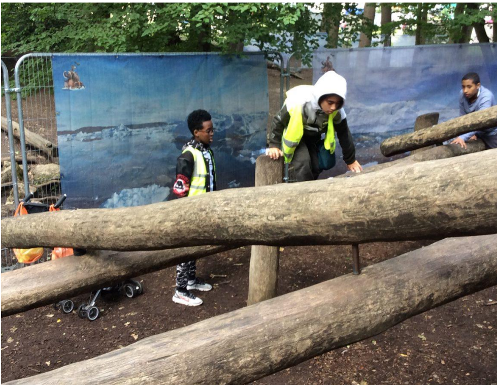
We climbed as part of our recreational and fitness sessions