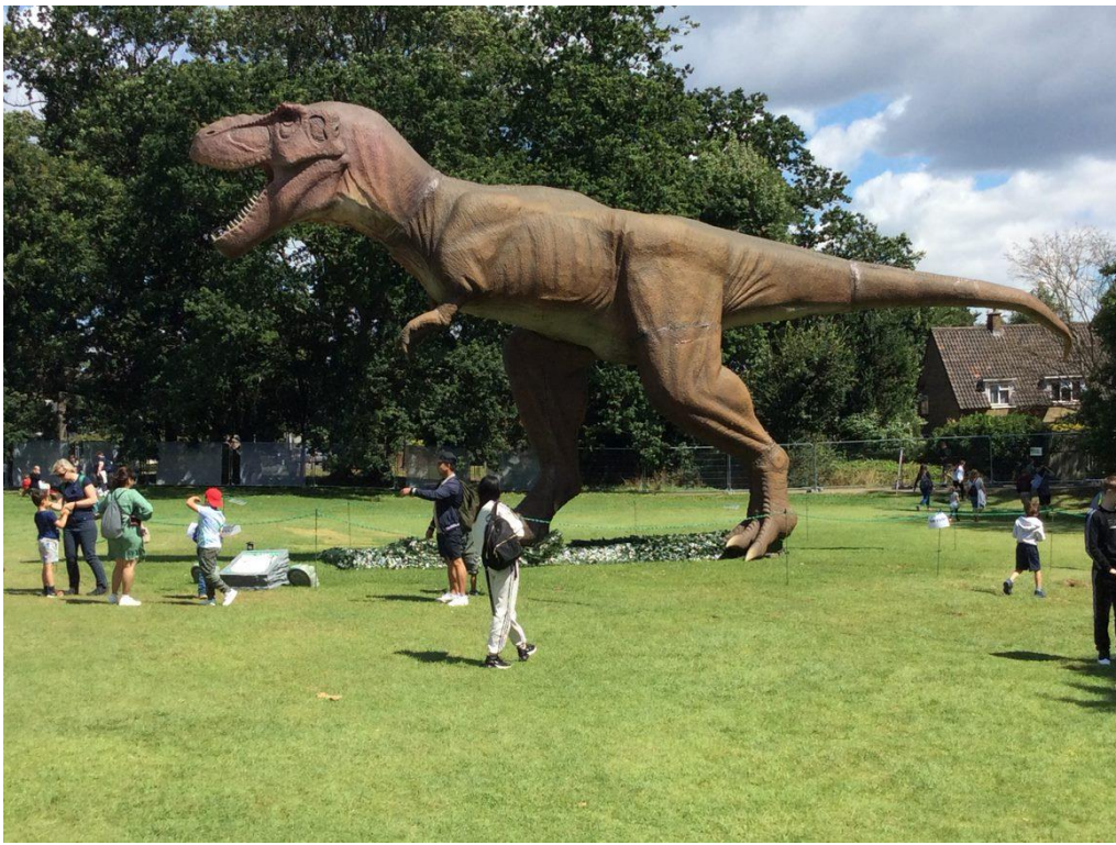
A Blast from the Past – History tours had us learning about dinosaurs!