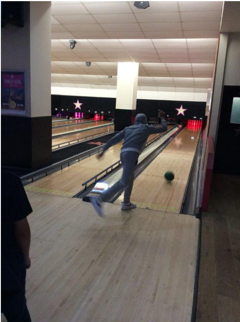
Teachers vs Pupils bowling tournament!